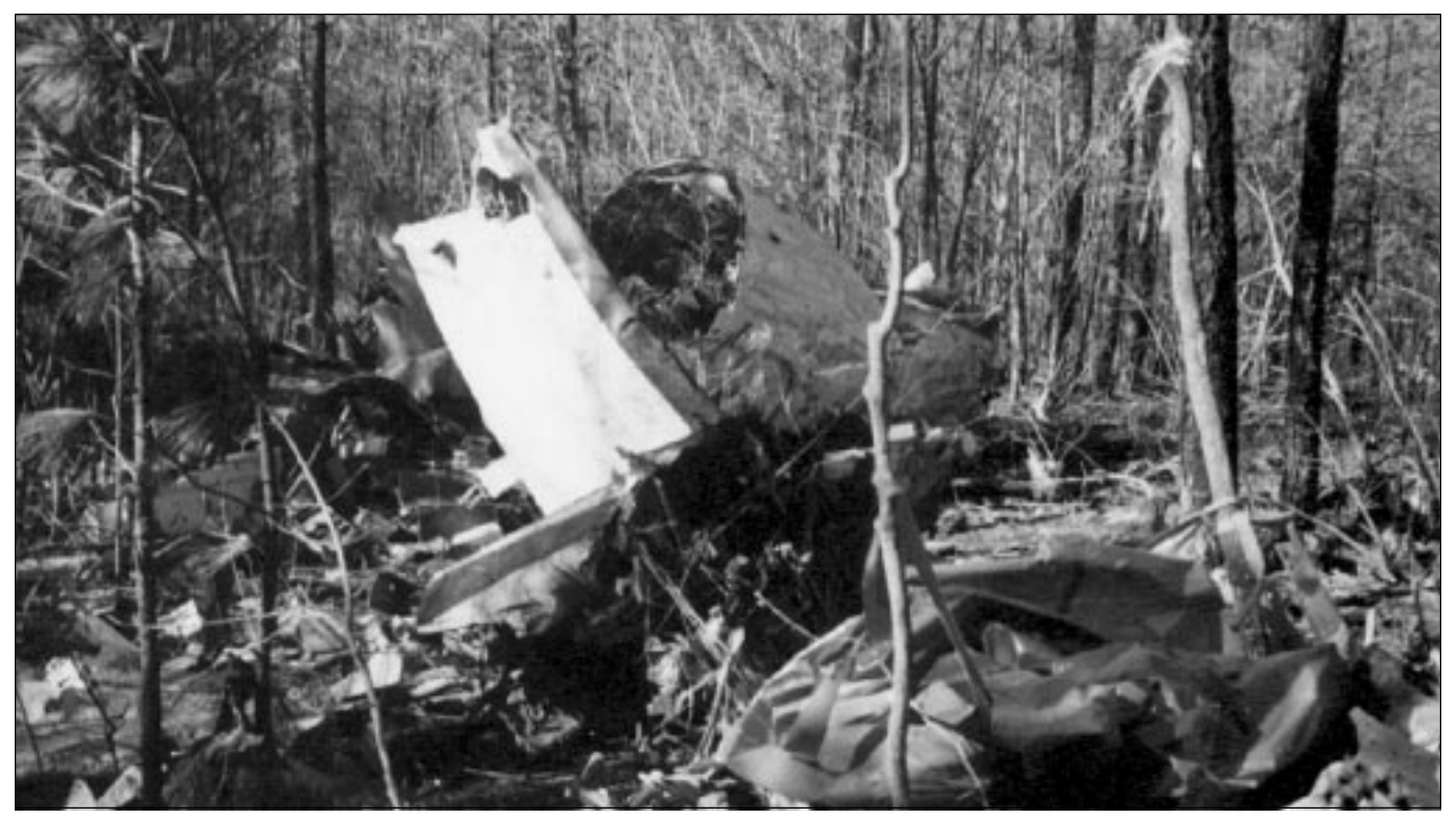
Wreckage is strewn in front of the remains of the aft fuselage.