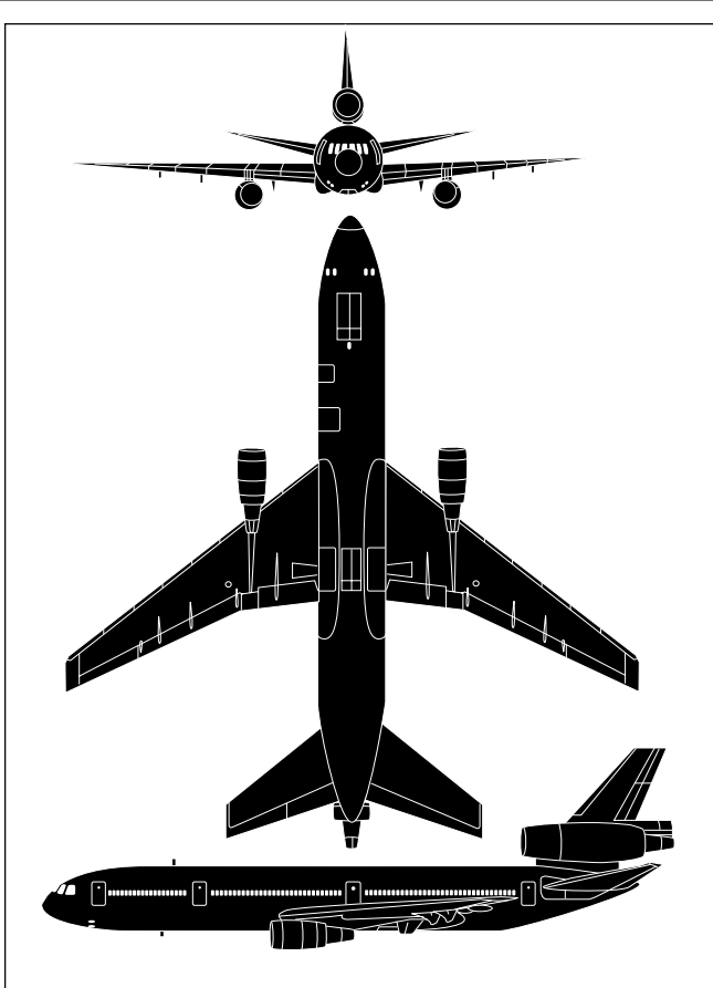
McDonnell Douglas DC-10

The McDonnell Douglas DC-10 first flew in 1970. It was designed as an all-purpose commercial transport able to carry 270 mixed-class passengers and 380 passengers in an all-economy configuration. The DC-10-30 series has a maximum takeoff weight of 263,085 kilograms (580,000 pounds), a maximum cruising speed of 490 knots (908 kilometers per hour) and a service ceiling of 10,180 meters (33,400 feet). The DC-10-30 has a range of 4,000 nautical miles (7,413 kilometers) with maximum payload at maximum zero-fuel weight.